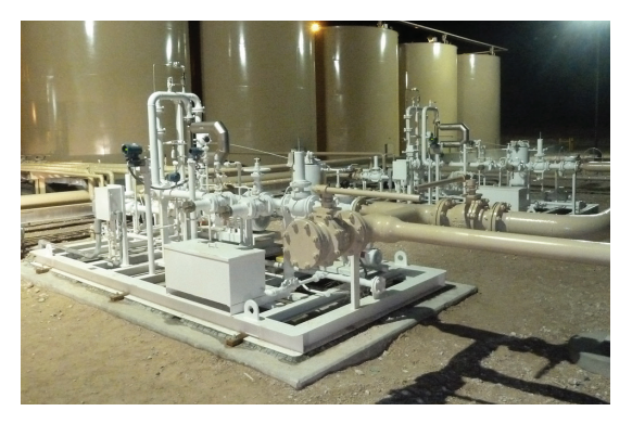
Lease Automatic Custody Transfer (LACT) unit